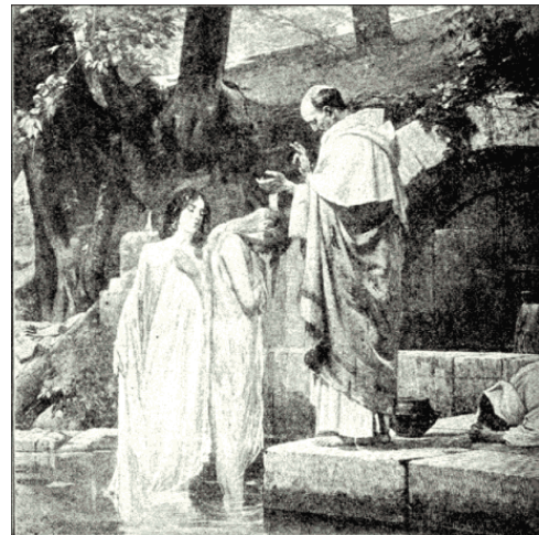
SAINT PATRICK BAPTIZING TWO IRISH MAIDENS

St. Patrick and the Celtic Church – Celtic Ireland was never ruled by a single powerful king, but rather by local tribal chiefs. A large part of Ireland's inability to resist the continued oppressions of England rested on this fact, that the Irish, from their earliest history, were disorganized and disunited. Ireland never came under Roman rule, and therefore never enjoyed the benefits of an advanced civilization or centralized government. There were no roads, bridges, sewers, aqueducts, or public buildings of note, and the weapons and tactics of the Celtic tribes could not resist the organized armies of more advanced civilizations.